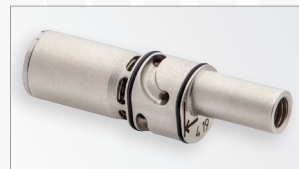
Generator for RQ-53 REF 06840300 for RQ-54 REF 06793000