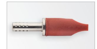
Water filter with resuction stop for BC connections REF 07092500 for RM connections REF 07095500