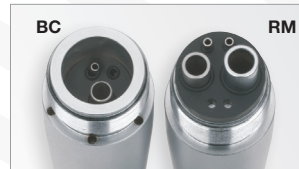
Coupling seal BC REF 01000700 RM REF 02207300