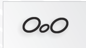
O-ring set for Roto Quick couplings REF 07508900