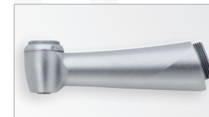
Contra-angle head for WE-56 REF 07549900 for WE-57 REF 07550000 for WE-66 REF 07550100