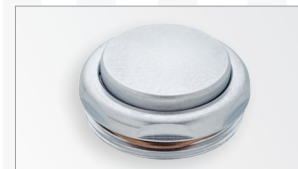
Push-button for TE-95 RM, TE-95 VC, TE-98, TE-98 RM, TE-98 BC REF 06641900 for TE-97, TE-97 RM, TE-97 BC REF 07548000