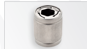
Torque wrench for replacing the rotor REF 07508800