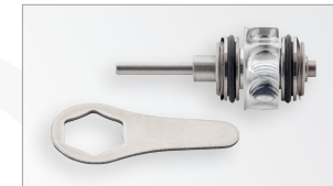
Rotor with hexagon wrench for TE-98 LQ, TE-98, TE-98 BC, TE-98 RM REF 06787500 for TE-97 LQ, TE-97, TE-97 BC, TE-97 RM REF 07234100 for TE-95 RM REF 07495400